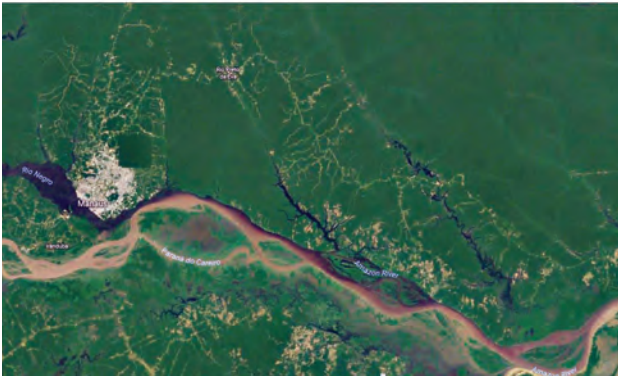
Figure 7.2 a : The lowlands of Amazon River