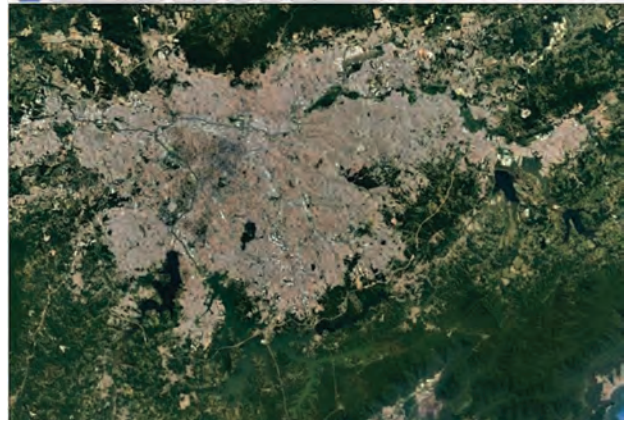
Figure 7.2 b : Sao Paulo

soil which makes it ideal for growing coffee. It also has a large supply of natural minerals close by, such as iron ore and it also has a steady energy supply. The South Eastern area has a good transport system too. This makes the Sao Paulo area a nucleated settlement. See Figure 7.3.