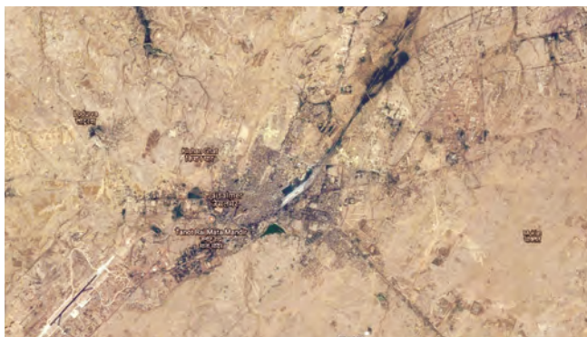
Figure 7.1 a

Study the two types of settlement patterns in India given in figure 7.1 (a) and 7.2 (b). Answer the following questions :