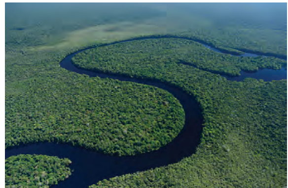
Figure 7.4 : Rain Forest in Amazon River Basin