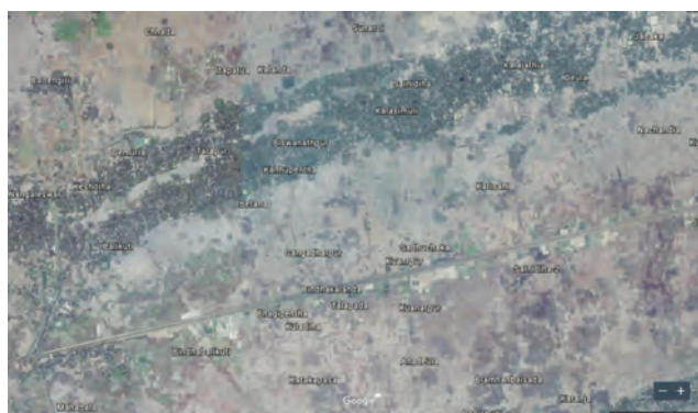
Figure 7.1 b

Tell whether settlements shown in images 7.1 (a) and (b) are urban or rural.