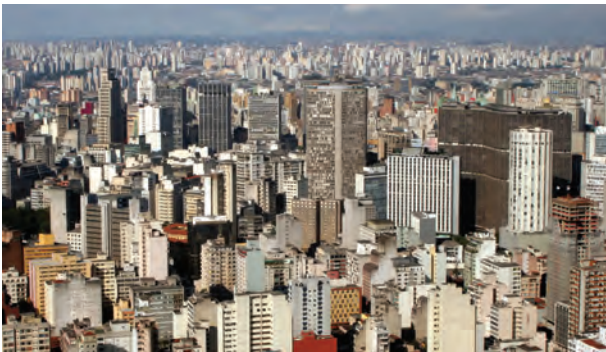
Figure 7.3 : City of Sao Paulo