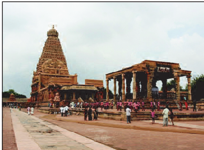
Fig.: 1.3 The Tanjawoor Vrihadishwar (Rajarajeshwar) temple

Taxes on land and its produce and taxes on trade were their main sources of revenue. The tax on land could be up to one-third of the value of the produce. When public works like building roads, tanks and canals had to be constructed,