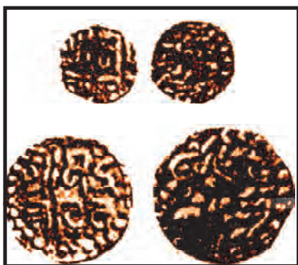
Figure: 1.2 Coins used during ratnadeo ruler (12th century)

The Kalchuri kings considered themselves Rajputs . There were several other influential Rajput dynasties in north, north-west and central India. Prominent among them were the Chauhans, Tomars, Parmars, Gurjars and Pratiharas. Members of these royal lineages established independent kingdoms at different places.