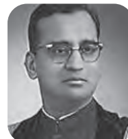
V. K. R. V. Rao