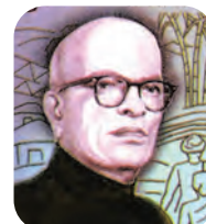
D. R. Gadgil

According to NIC “A national estimate measures the volume of commodities and services turned out during a given period counted without duplication.”