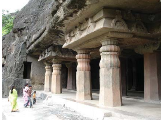
1.8 Ajanta Caves

The armies of Harshavardhan and Pulkeshi II fought a great battle near River Narmada in which the former was defeated. This halted Harsh's expansion towards South India and so the empire of Kanauj could not extend beyond Narmada.