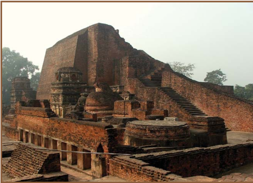
1.4 Nalanda Vidyapith