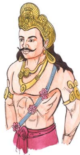
1.7 Pulakeshi - II

The Kings of the Chalukya (Solanki) dynasty established a vast empire in South India which they ruled from their capital at Vatapi (Badami- Karnataka). Pulakeshi I, a great king of the Chalukya dynasty, performed the Ashwamegha yagna. His flag had the symbol of 'Varahavtar'. His son, Kirtivarma, ascended the throne after him. He was succeeded by his brother, Manglesh who built the grand Vishnu temple at Vatapi. After him, the righteous Pulakeshi II became king and ruled over the empire for about 30 years.