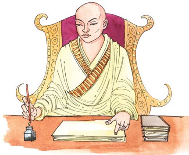
1.5 Huen Tsang