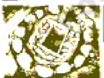
Fig: 17.9 Megalith - Burial site

These stone boulders are known as megaliths (literally big stones). These were carefully arranged by people, and were used to mark burial sites. The practice of erecting megaliths began about 3000 years ago, and was prevalent throughout the Decean, South India, in the North-East and Kashmir.