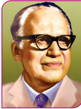
P. K. Atre

Beginning of actual conflict : Discontent among the Marathi speaking people was growing. A grand march led by Senapati Bapat was taken to Vidhan Sabha. Morarji Desai was the Chief