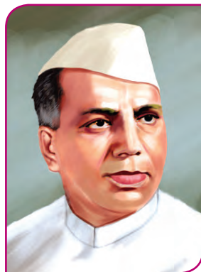
Yashwantrao Chavan Yashwantrao Chavan accepted the responsibility as first Chief Minister of Maharashtra.

the making of Maharashtra due to the agitation led by Samyukta Maharashtra Samiti. At this instance, Indira Gandhi, President of Congress supported the Samyukta Maharashtra movement. The Central Government consented the two linguistic states- Maharashtra and Gujarat. In April 1960, the Parliament passed the Mumbai Reorganisation Act. According to this Act, Maharashtra State was formed on 1 May 1960.