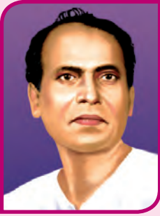
Lokshahir Annabhau Sathe