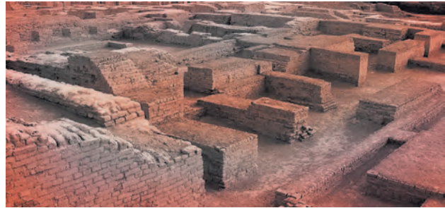
A multi-roomed house at Mohenjodaro

The remains at Mohenjodaro were considerably intact. So the glory of the city was revealed in way of the houses, majestic buildings, wide streets, etc. Thus the evidence of the impressive town planning, and public administration, characteristic of the Harappan civilisation came into light. The town planning of the Harappan cities can be easily compared with the town planning of a modern city like