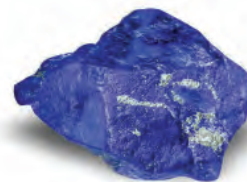
Lapis lazuli stone

Not that all the pre-Harappan settlements were transformed into cities and towns. Some of them did not change notably. There was a network of small towns, small and big villages and camp sites of semi-nomadic people, which functioned to cater to the needs of major urban centres of the Harappan civilisation. It included villages in remote regions as well. The best example of it is the Harappan settlement of 'Shortugai' in the Badakshan province of Afghanistan. This region is rich with mines of lapis lazuli. There was a great demand for this semi-precious stone in Mesopotamia. The Mesopotamian epics describe Goddess Inanna's palace, the walls of which were embedded with this stone. This stone was a very important commodity in the Harappan trade with Mesopotamia.