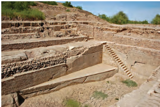
The Water Tank at Dholavira