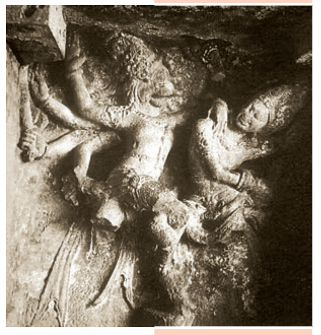
Fig. 1 Wall relief from Cave 15, Ellora, showing Vishnu as Narasimha, the man-lion. It is a work of the Rashtrakuta period.

Many of these new kings adopted high-sounding titles such as maharaja-adhiraja (great king, overlord of kings), tribhuvana-chakravartin (lord of the three worlds) and so on. However, in spite of such claims,