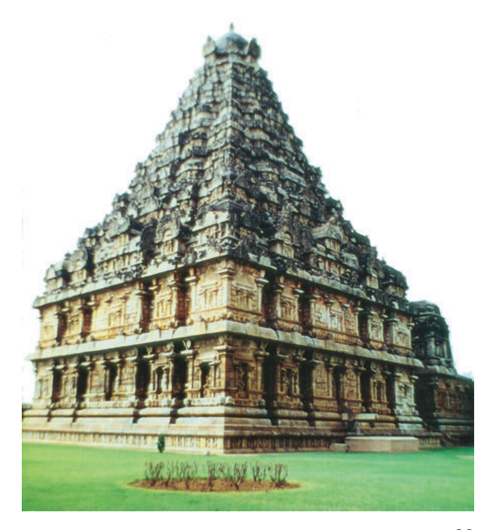
Fig. 3 The temple at Gangaikondacholapuram. Notice the way in which the roof tapers. Also look at the elaborate stone sculptures used to decorate the outer walls.

Chola temples often became the nuclei of settlements which grew around them. These were centres of craft production. Temples were also endowed with land by rulers as well as by others. The produce of this land