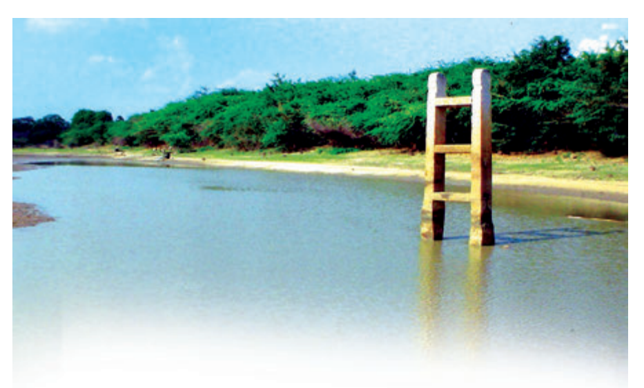
carry water to the fields. In many areas two crops were grown in a year.

In many cases it was necessary to water crops artificially. A variety of methods were used for irrigation. In some areas wells were dug. In other places huge tanks were constructed to collect rainwater. Remember that irrigation works require planning – organising labour and resources, maintaining these works and deciding on how water is to be shared. Most of the new rulers, as well as people living in villages, took an active interest in these activities.