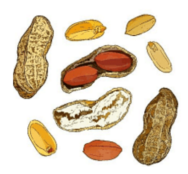
Ans. Choose the correct adjective.