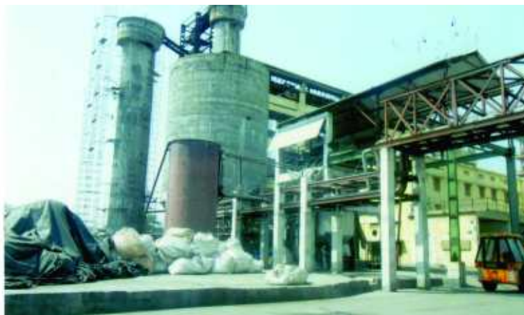
Fig 11.6 Pulping machine (Fiber line)

Through this process the wood chips are turned into thin fibres (like cotton fibres). The liquid pulp is then whitened using chemicals. Then it becomes creamy. We found the liquid pulp in milky white colour without any dust.