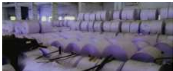
Fig 11.9 Rolls of papers

There are large number of factories in our state and country which produce diverse articles of use. They produce them in large quantities in a short time.