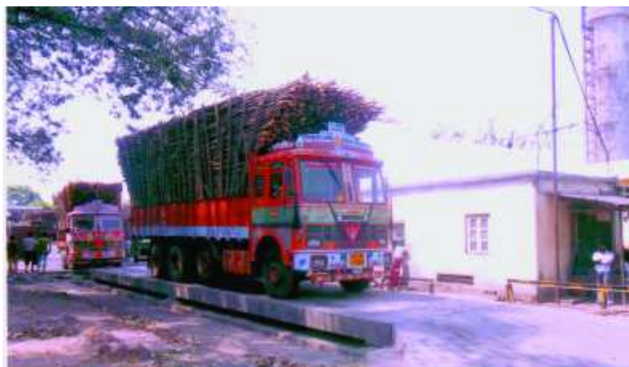
Fig 11.2 Lorries waiting with bamboo loads

Factories require large and continuous supply of raw materials. You will find dozens of lorries supplying raw materials to them every day. Paper mills generally use wood from bamboo, eucalyptus and subabul trees. Subabul wood is most widely used now. Besides wood a large number of chemicals such as common salt, caustic soda and so on are also used in different stages of paper making. Scrap paper is also recycled in paper mills.