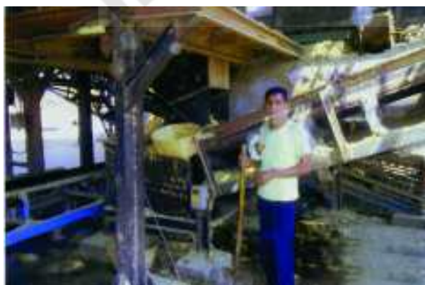
Fig 11.4 Labourer at chipping machine

(ii) Making of wood pulp : The small wood chips are sent to fibre line section. In this section, the wood chips are boiled with some chemicals in large vessels.