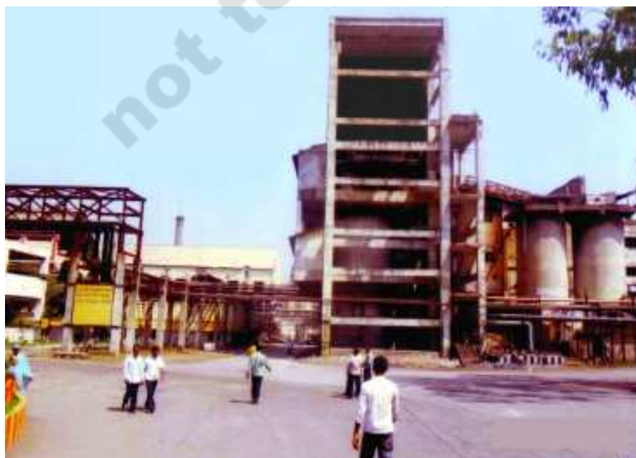
Fig 11.1 Factory from outside

Materials required to produce a commodity are called raw materials.