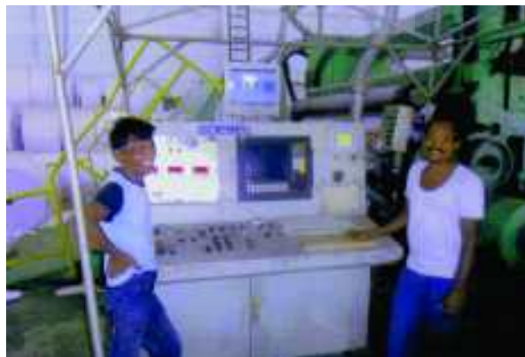
Fig 11.5 Labourers at setting machine