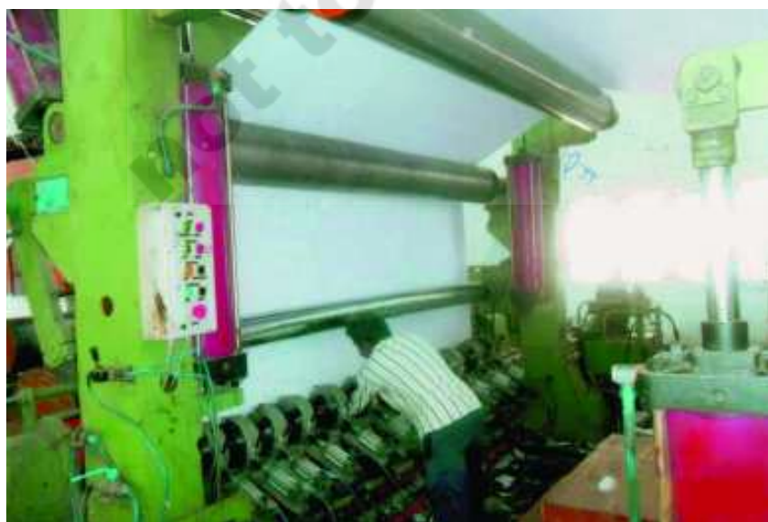
Fig 11.7 Paper cutting machine

floor. All this has to be cleaned and the machines are to be dusted properly. She is paid on a daily basis and many days she does not get any work. She is paid about Rs.100-150 a day. Though she has been working for more than three years, she earns only Rs. 2500 a month. She is also not entitled to any of the facilities that are available to permanent workers like Anand.