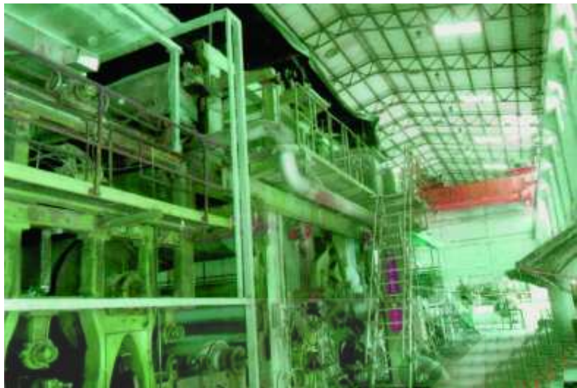
Fig 11.8 Inside the factory