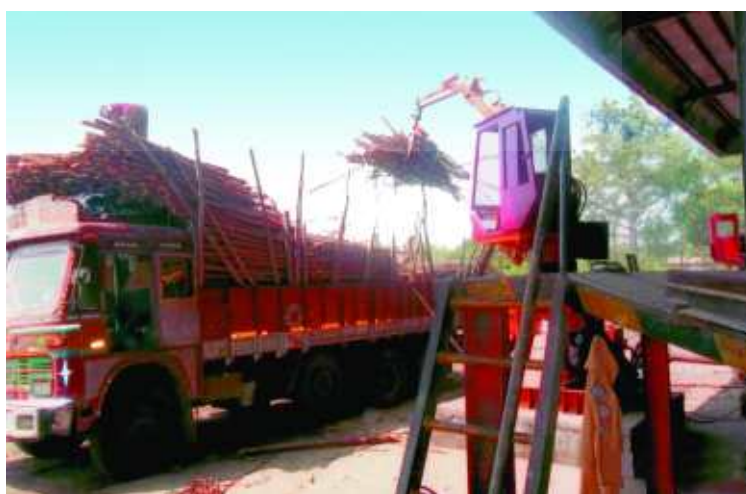
Fig 11.3 Bamboo lifter