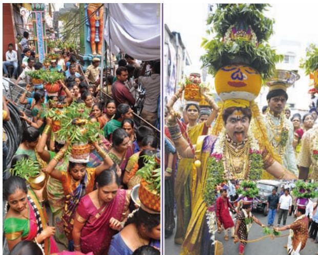
Fig 20.10 Bonalu

ornamented pots filled with flowers on their heads. The women devotees also carry brass vessels or clay pots filled with cooked rice and decorated with neem leaves. The male dancers who accompany them are known as Pothurajus, who lead the procession by lashing whips and holding neem leaves.