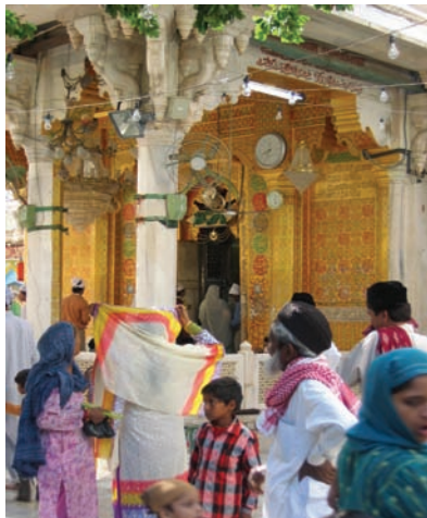
Fig 20.8 Ajmeer Dargah