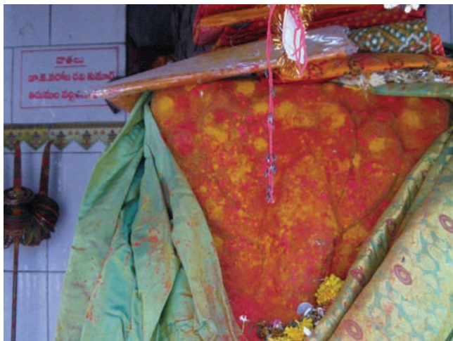
Fig 20.4 Yellamma