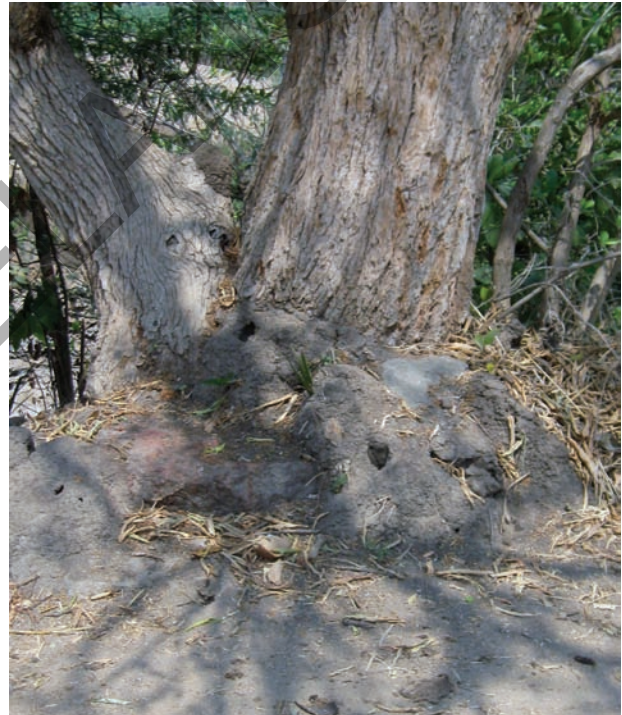
Fig 20.3 Maisamma

Yellamma: Yellamma is also called as Poleramma, ‘Maridamma’, ‘Renuka’ Mahankali, Jogamma, Somamma and by