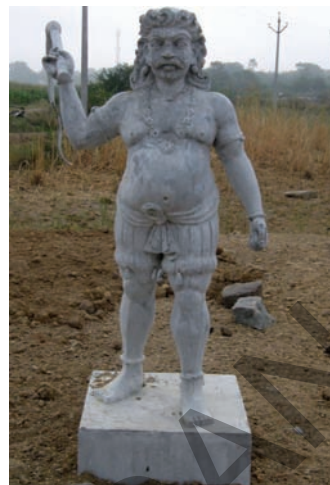
Fig 20.5 Potharaju

animals. The farmers keep a small stone painted in white in a corner of their fields. The worship of Potharaju is very simple. Prayers are offered to the deity when the crop is harvested. He has sisters who are called by various names like Peddamma.