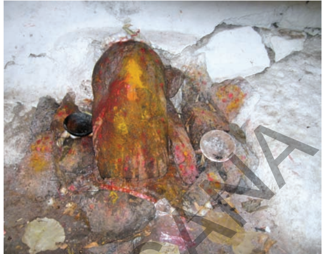
Fig 20.1 & 20.2 Here are two idols of Pochamma.

with flowers, etc. in their own language: “Mother, we have seeded the fields, now you must ensure good crop.” “My daughter is sick, you must cure her.” “Mother, keep away all infectious diseases and evils from our family.” They offer a part of the bonam and sometimes also offer a chicken or a sheep.