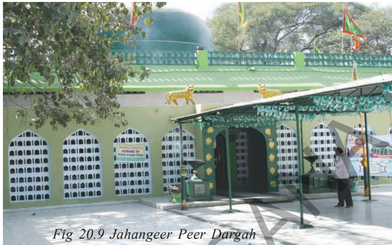
Fig 20.9 Jahangeer Peer Dargah

visit the dargahs in large number, offer flowers and chadars (sheets on the grave) and listen to the singing of Qawwalis. They believe that they will receive the ' barkat ' or blessings of the pir or saint. People who seek some specific blessings like children or job, etc. come to the dargahs and pray there.