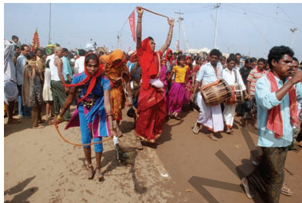
Fig 20.7 Scene from Medaram Jatara

The Medaram Jatara is organised once in two years. It is a three day fair. Sammakka and Sarakka are the formless goddesses. Caskets representing them are brought from the forests in an elaborate procession, brightly decorated and placed on the platform under a tree. At that time, devotees feel the spirits or the goddess possesses them. The people offer ‘ bangaram ’, jaggery, to the goddess.