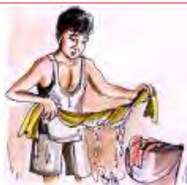
rinsing a shirt