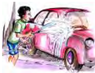
shining a car