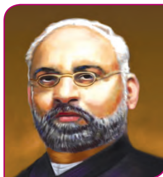
Pt. Shyamji Krishna Varma

India House : The revolutionary work in India received assistance from Indian revolutionaries staying abroad. India House, in London, was an important centre which provided for such kind of assistance. Pandit Shyamji Krishna Varma, an Indian patriot, had established