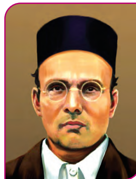
Swatantryaveer V. D. Savarkar

Swatantryaveer Vinayak Damodar Savarkar founded 'Mitramela'- a secret organisation of revolutionaries in Nasik. The same organisation was renamed as 'Abhinav Bharat' in 1904. Savarkar went to England for higher education. From there he began sending revolutionary literature,