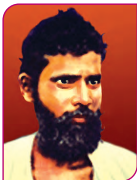
Vasudev Balwant Phadke

Maharashtra, Vasudev Balwant Phadke gave an armed struggle against the British. He assumed that there should be armed struggle to fight against the British. He took the training of arms from Vastad Lahuji Salve. He organised the Ramoshis and revolted against the British. This rebellion became unsuccessful. The British Government sent him to Eden jail. There he died in 1883. He built up an armed struggle for independence.