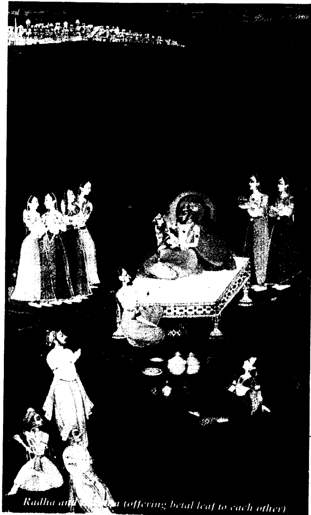
Radha and Krishna (offering betel leaf to each other)