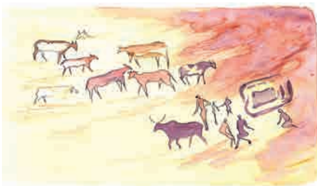
Stone age Cave painting from Bhimbetka

All that humans sensed or understood about the world found expression in manifold ways. They also perceived beauty in worldly objects and events apart from their properties, co-relations. The beauty fascinated them and inspired them to create beauty in response. From this emerged music, dance, painting and several other art practices. Art offers us the opportunity to indulge in life without being occupied with utility or profitability. It delights both the creator and the appreciator. Creativity is essential for art.