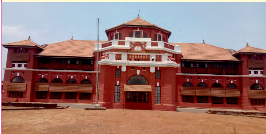
Thibaw Palace, Ratnagiri

Lokmanya Tilak, who was born in Ratnagiri was kept in the jail at Mandalay in Myanmar with a view to keep him away from the Indian Movement of Independence. Tilak wrote 'Geetarahasya' in this prison. Later, Netaji Subhash Chandra Bose was also sent to Mandalay jail.