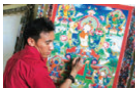
Fig.5 Basohli Painting

Articles, like tea pots, cups, saucers, tumblers boxes, trays, mirror frames, items of decoration are chief articles of production by this industry. This work requires skill and craft. Engraving is a speciality of Kashmiri engravers. Moreover, Kathua District in Jammu region is famous for its handicrafts especially for Basohli paintings, Calico paintings and Phoolkari work. Ladakh region is also famous for, clay modelling and "Thanka paintings" .