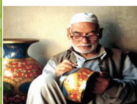
Fig.4 Paper Machie

It is a unique, attractive and exclusive handicraft of Kashmir. Paper and pulp are shaped into a variety of decorative articles and colourful designs are painted on them. The centres of production include Rainawari in Srinagar and Anantnag Districts.