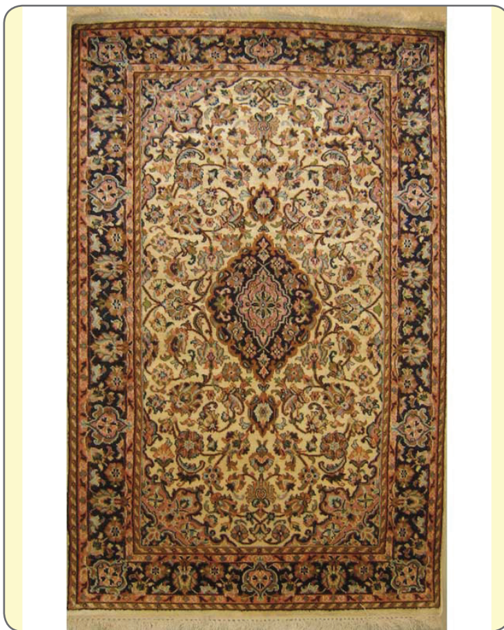
Fig: 1 Carpet (Qaleen)

The art of carpet weaving to Kashmiris is the gift of central Asia through Caravans. The products are highly priced all over the world with an excellent demand especially in Middle East and Europe, where most of the produce are exported. The workers of this industry are found in almost all districts of Kashmir, whereas the maximum units of carpet making are concentrated in an around the Srinagar city.