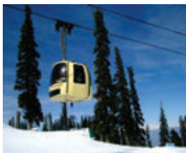
Fig 6: Gandola Gulmarg

The extraction of the minerals has come up in various parts of Jammu, Kashmir and Ladakh and as such many mineral based industries have been established in both public and private sector. The calcareous and argillaceous minerals i.e. limestone, gypsum, bauxite, and clay are the main ingredients of cement industry and are mainly available in Baramulla, Anantnag, Reasi and Basohli. Some public sector cement plants have been established such as Wuyan cement factory, PCF Bari Brahmna run by JK Minerals Ltd. and Khrew cement factory run by JK cements Ltd. Besides bricks and tile factories are also located at varied locations over the regions. A modern industrial centre is fast emerging at Bari Brahamna Jammu which has provided boost to the manufacturing sector in J&K. It deals mostly with fast moving consumer goods (FMCG) and other consumer durables.