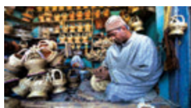
Fig.3 Kangri Making