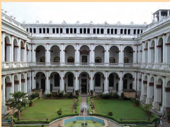
Indian Museum, Kolkata

The 'Indian Museum' at Kolkata was founded by the Asiatic Society in 1814 C.E. Nathaniel Wallich, a Danish botanist was the founder and the first curator of the museum. The photograph of the museum seen here is dated to 1905. The museum has three main departments, Arts, Archaeology and Anthropology. Other affiliated departments are : conservation, publication, photography, exhibition-presentation, model-making, training, library, security.