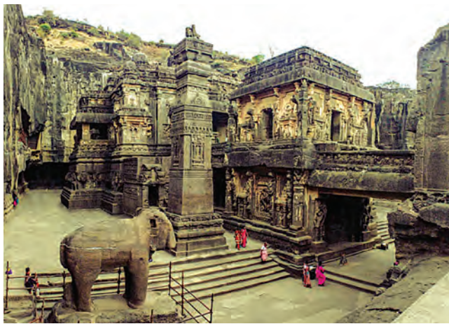
Kailasa Temple, Verul

‘Cultural and Natural Heritage Management’ is one of the main aspects of applied history. The work of conservation and preservation of the Cultural Heritage falls under the jurisdiction of the Archaeological Survey of India and India’s State Departments of Archaeology. Beside, INTACH (Indian National Trust for Art and Cultural Heritage) is actively working in this field. The work of conservation and preservation of cultural and natural heritage requires participation of experts from various fields. They need to be duly aware of the cultural, social and political histories of the heritage site. Principles of applied history are useful in creating the awareness among them. Thus,