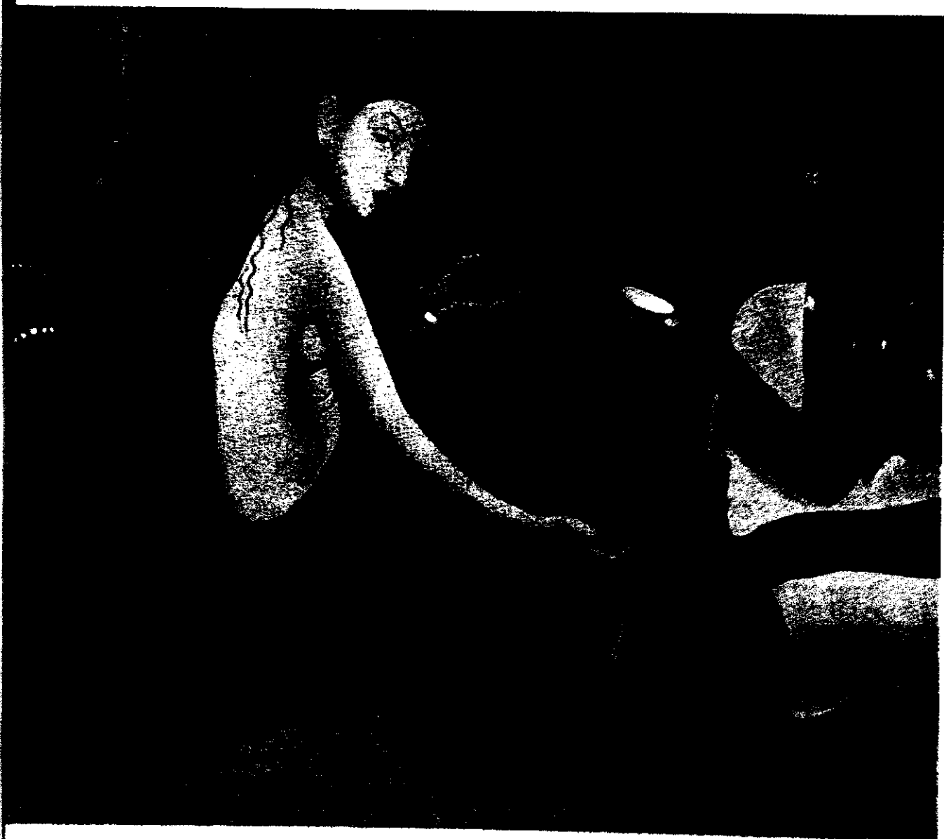
Adornment of Bride