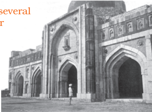
Fig. 4 Moth ki Masjid, built in the reign of Sikandar Lodi by his minister.

The Delhi Sultans built several mosques in cities all over the subcontinent. These demonstrated their claims to be protectors of Islam and Muslims. Mosques also helped to create the sense of a community of believers