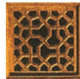
Fig. 5 Mosque of Jamali Kamali, built in the late 1520s.

who shared a belief system and a code of conduct. It was necessary to reinforce this idea of a community because Muslims came from a variety of backgrounds.