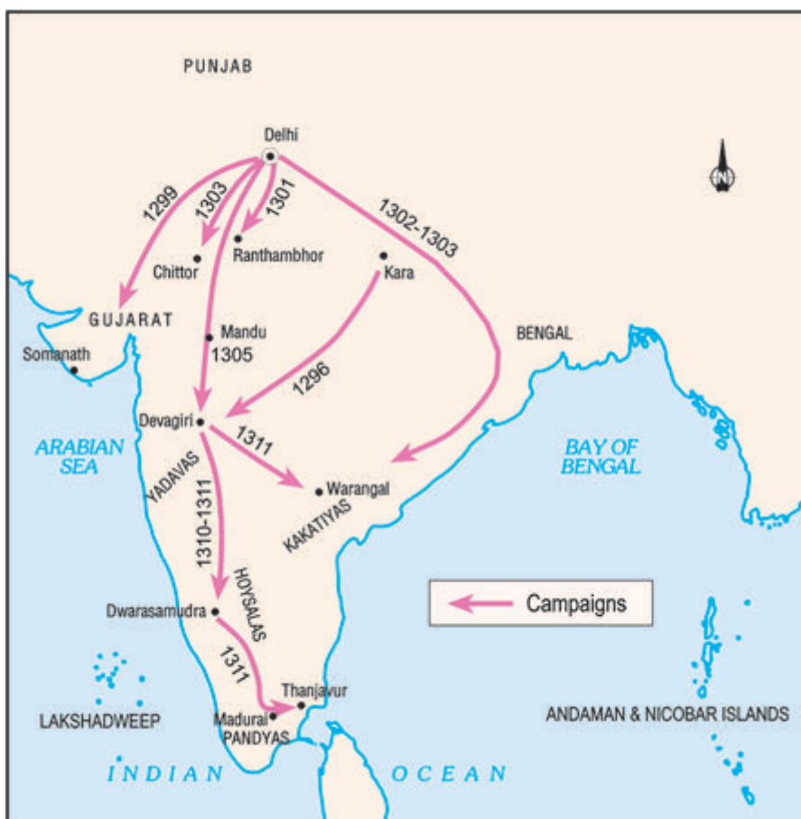
Map 3 Alauddin Khalji's campaign into south India.

By the end of Muhammad Tughluq’s reign, 150 years after somewhat humble beginnings, the armies of the Delhi Sultanate had marched across a large part of the subcontinent. They had defeated rival armies and seized cities. The Sultanate collected taxes from the peasantry and dispensed justice in its realm. But how complete and effective was its control over such a vast territory?