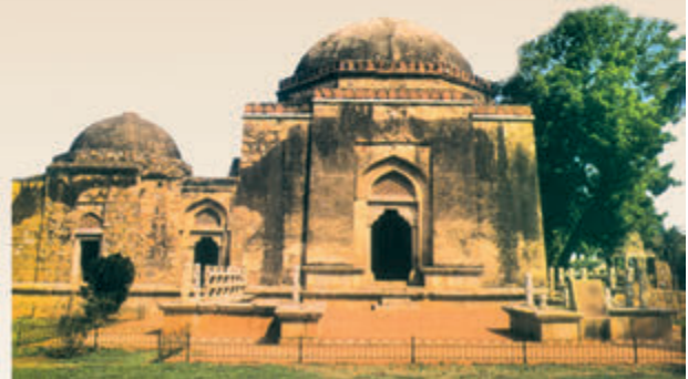
Firuz Shah Tughluq's tomb