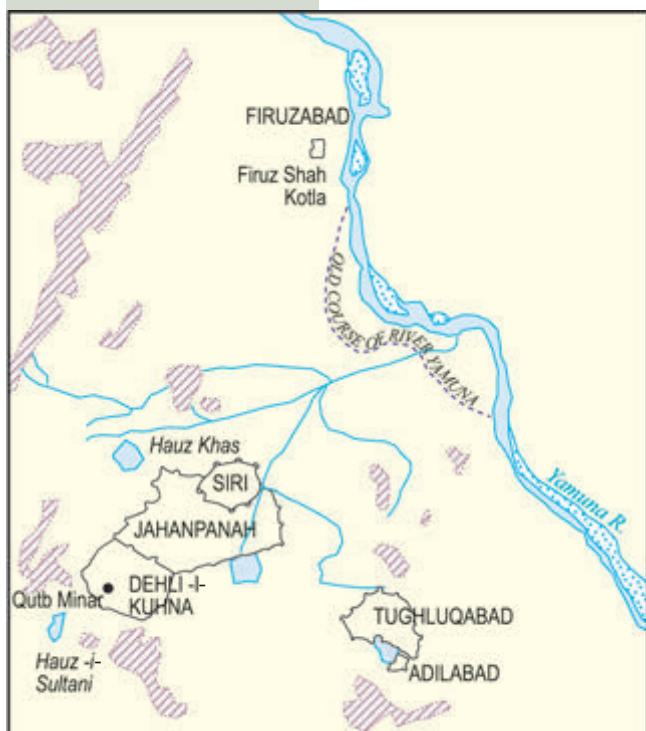
Map 1 Selected Sultanate cities of Delhi, thirteenth-fourteenth centuries.

The transformation of Delhi into a capital that controlled vast areas of the subcontinent started with the foundation of the Delhi Sultanate in the beginning of the thirteenth century. Take a look at Table 1 again and identify the five dynasties that together made the Delhi Sultanate.