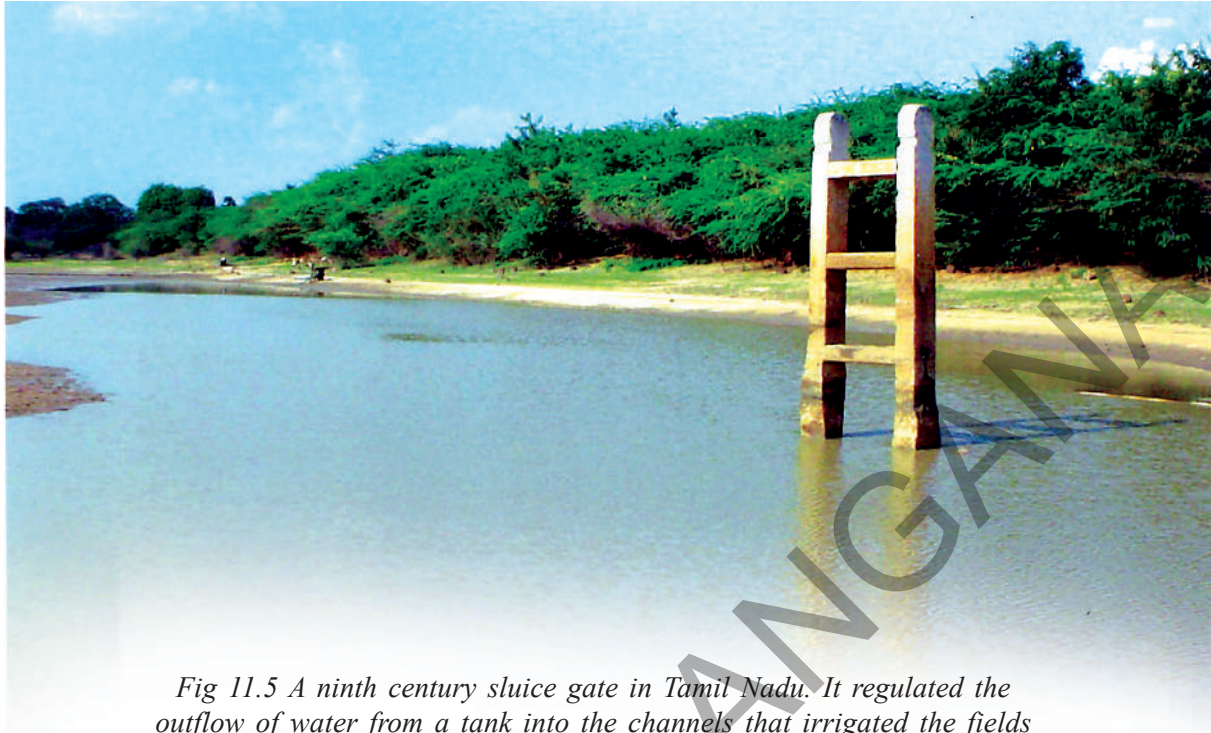
Fig 11.5 A ninth century sluice gate in Tamil Nadu. It regulated the outflow of water from a tank into the channels that irrigated the fields

Although agriculture had developed earlier in other parts of Tamil Nadu, it was only from the fifth or sixth century that this area was opened up for large-scale cultivation. Forests had to be cleared in some regions; land had to be levelled in other areas. In the delta region, embankments had to be built to prevent flooding and canals had to be constructed to carry water to the fields. In many areas, two crops were grown in a year.