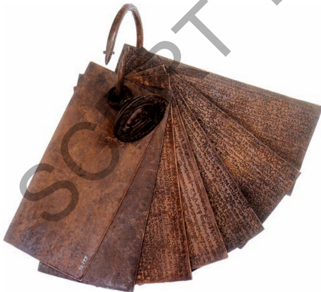
Fig 11.2 This is a set of copper plates recording a grant of land made by a ruler in the ninth century, written partly in Sanskrit and partly in Tamil. The ring holding the plates together is secured with the royal seal, to indicate that this is an authentic document

Kings often rewarded brahmins and others who served them by grants of land. These were recorded on copper plates, which were given to those who received the land.