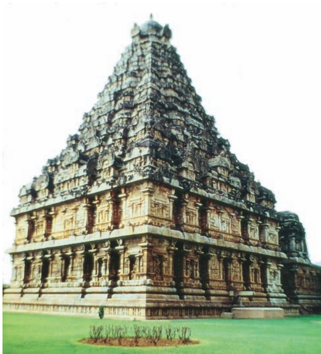
Fig 11.3 The temple at Gangaikonda-Cholapuram. Notice the way in which the roof tapers. Also, look at the elaborate stone sculptures used to decorate the outer walls

powerful Chola ruler, became the king in 985 CE and expanded his control over most of these areas. He also reorganised the administration of the empire. Rajaraja's son Rajendra I continued his policies and even conquered the Ganga valley, Sri Lanka and countries of Southeast Asia, developing a navy for these expeditions.