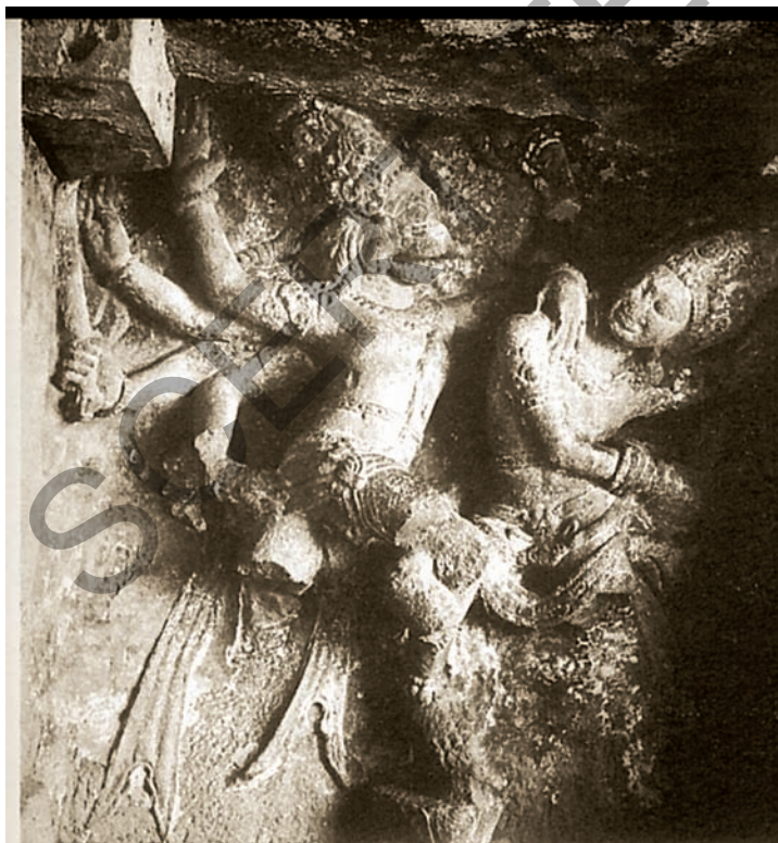
Fig 11.1 Wall relief from Cave 15, Ellora, showing Vishnu as Narasimha, the man-lion. It is a work of the Rashtrakuta period

The invocation part of an inscription is Prashasti . Prashastis contain details about the ruling family such as their predecessors and the period to which they belonged. They also contain encomiums of rulers and their achievements. But they tell us about how rulers wanted to depict themselves, for example valiant, victorious warriors. These were composed by learned brahmins, who occasionally helped in the administration.