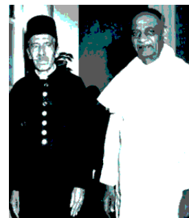
Fig 12.3: Osman Ali Khan and Sardar Vallabhai Patel

government of India to continue as the ruler till the transition to democratic setup was complete. The Nizam was forced to abolish the feudal system and initiate democratic processes of elections. When the Constitution of India came into force on 26 January 1950, the Nizam rule came to an end but Osman Ali Khan continued to be the Rajpramukh of Hyderabad (head of the state). But he had to act on the advice of Government of India's officials. Elections were held in 1952 and an elected government was formed in Hyderabad state. Burgula Ramakrishna Rao was the first Chief Minister of the Hyderabad state. The Nizam continued as Rajpramukh till 1956. With the formation of Andhra Pradesh merging Andhra and Telangana regions, the Rajpramukh was replaced by a Governor appointed by the President of India. Thus ended the Nizams rule of over Hyderabad state.