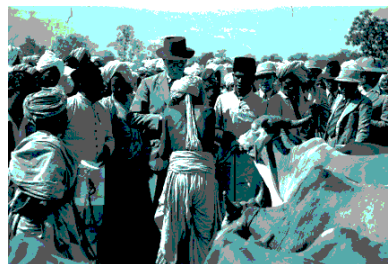
Fig 12.2: A Colonial officer as well as an Indian official from Nizam's court meeting people at Keslapur in Adilabad.