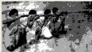
Fig 12.4: Women Guerrilla squad

Women suffered most under the rule of Nizams and doras . They were constantly harassed. They not only had to work for the landlords but also to serve the visiting officials. Many women were made slaves of the landlords. Such women attended the night schools of Andhra Maha Sabha and decided to join the Sanghams and the Communist Party. Some of them took arms and fought the Razakars , some of them sang songs and