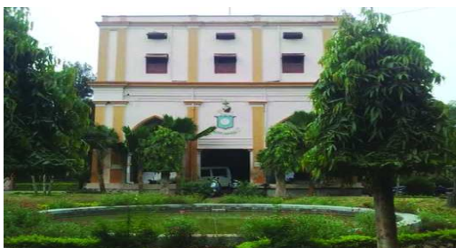
Fig 12.1: Nizam College