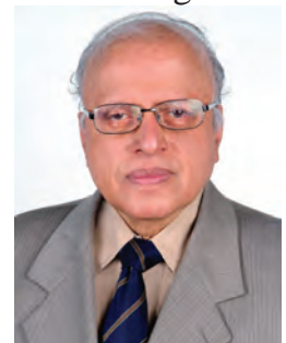
Dr M. S. Swaminathan