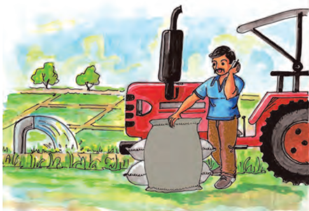
A farmer asking for information from an agricultural assistance centre

Agricultural assistance programme : Through this programme, farmers are given proper information and guidance about the latest technology, irrigation facilities, improved seeds, use of fertilizers and pesticides, etc. They can also get weather forecasts and other agriculture related information from these assistance centres.