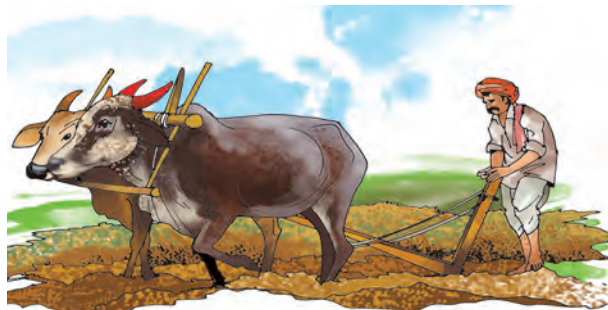
Ploughing the land

draw water from the well. Harvesting, threshing, etc. was done by the members of the farmer's family themselves with the help of oxen. However, farmers now carry out all these tasks with the help of machines.