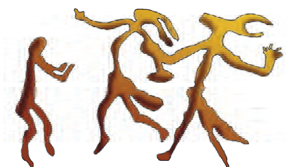
Pic.1.1 Wall Painting of Singhanpur Caves

Tamrapatra- writings engraved on metal plates etc.