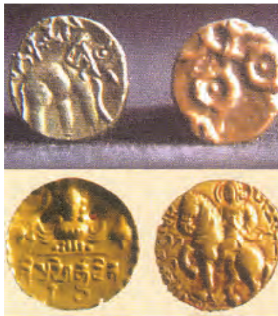
Pic.1.6 Old Coins & Currency