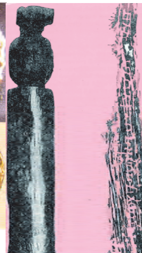
Inscribed pillar from Kirari village in Raipur Museum

Besides this history informs us about the various kings and their empires, and about all people- big and small of that time.