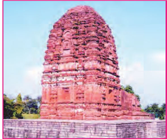
Pic 1.3 Laxman Temple, Sirpur

Teacher agreed and further said- when we return after a trip from anywhere, we tell people about that place and its people. Similarly, in ancient times also, foreign travellers would travel to several countries. The descriptions of their voyages provide a lot of information of that era.