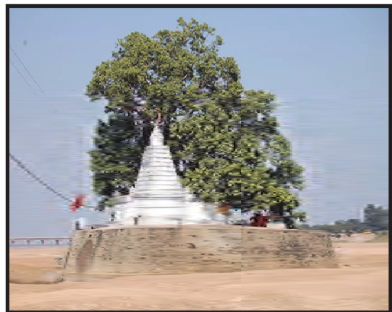
Pic.1.4 Kuleshwar Temple, Rajim,