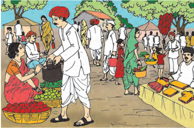
A weekly market