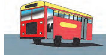
Means of transport